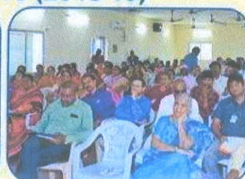
60 Delegates Participated