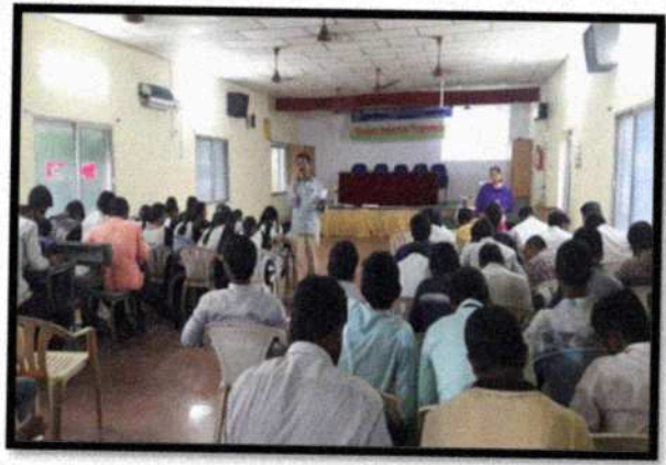
I B.Sc, ,M.P.C, M.P.Cs(E.M)