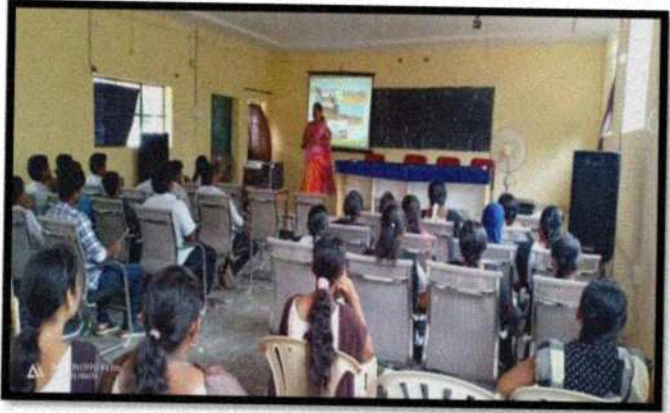
I B.Sc, B.Zc (T.M & E.M) ,M.P.C(T.M)