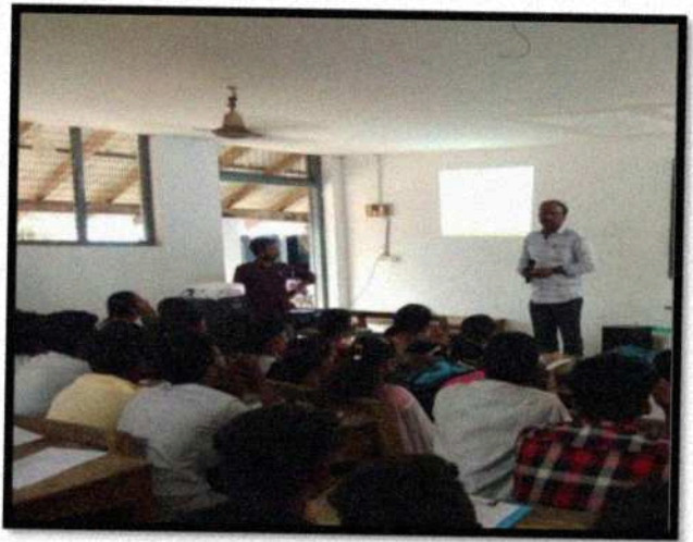
I B.Com(T.M & E.M)