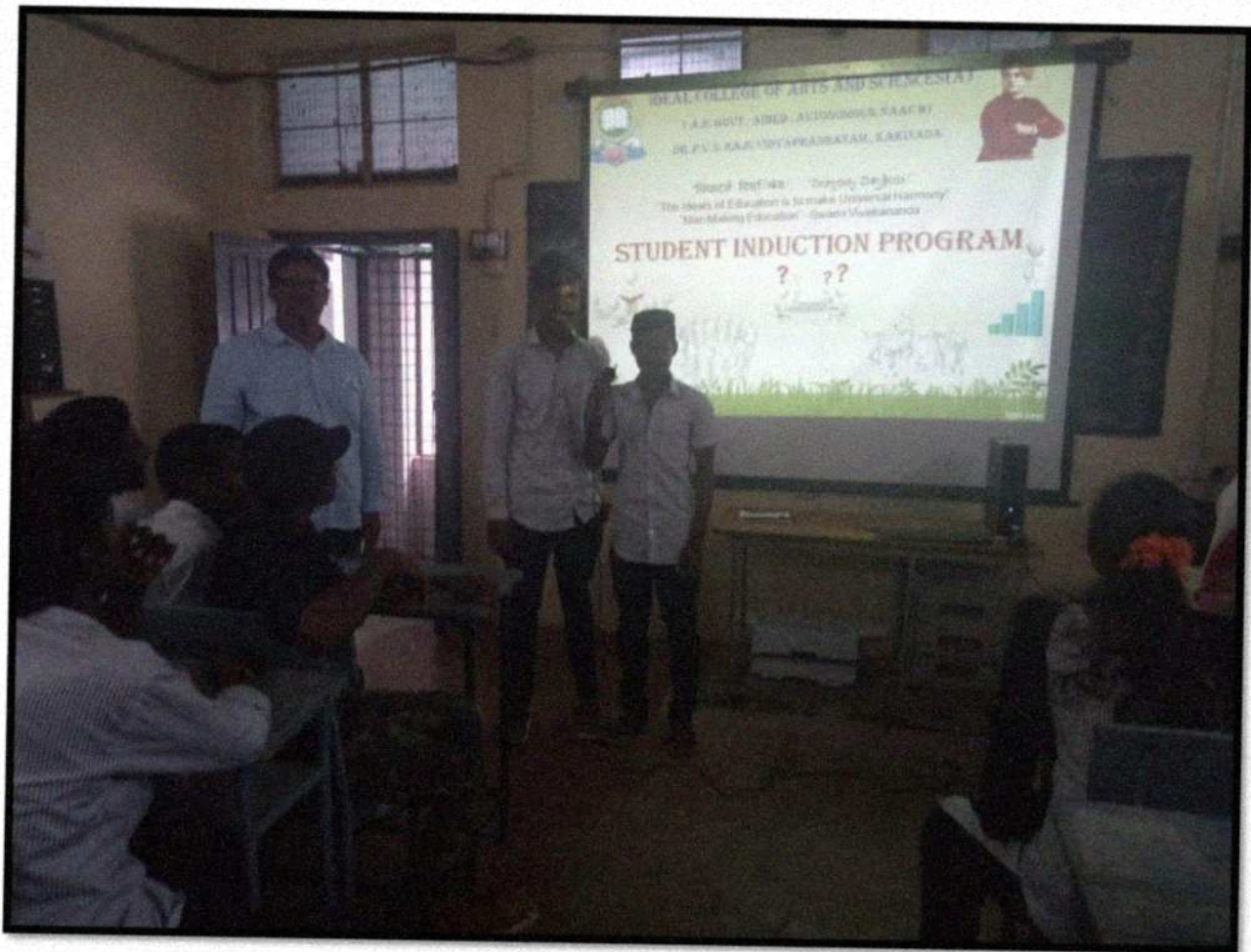
"Vandematharam" by I B.Sc, B.Zc Students Song By I B.A. Students