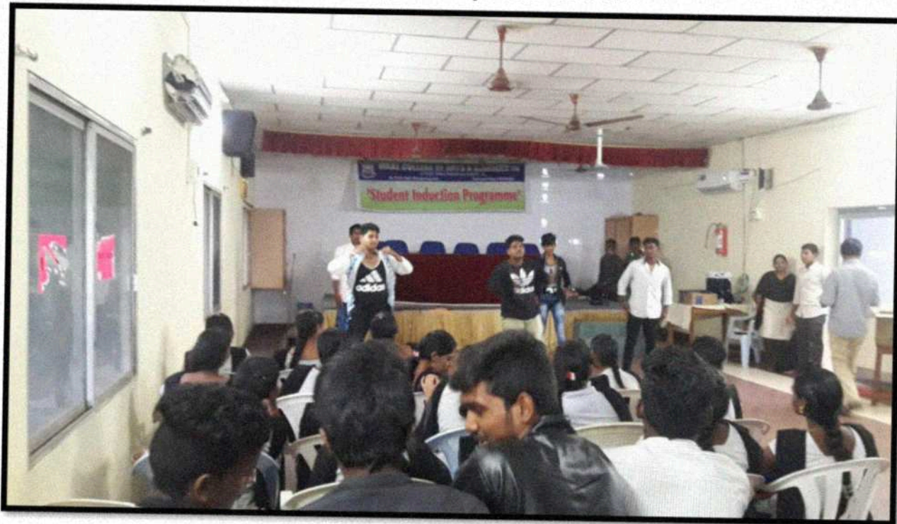
Group Dance by I B.Com Students